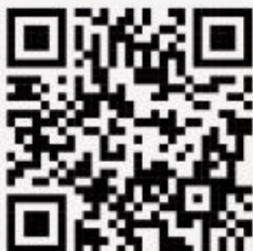
scan the QR code with your phone's camera to see the guides on our website